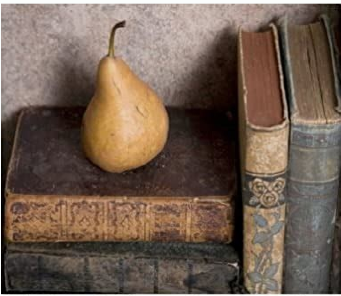
THE PLAYS OF WILLIAM SHAKESPEARE: WITH THE CORRECTIONS AND ILLUSTRATIONS OF VARIOUS COMMENTATORS. TO WHICH ARE ADDED NOTES. VOLUME 10...

WILLIAM SHAKESPEARE, GEORGE STEEVENS, SAMUEL JOHNSON, ISAAC REED